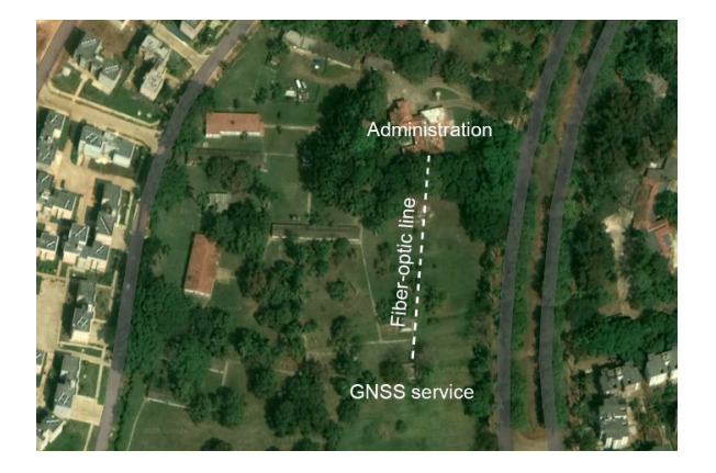
Figure 4. Satellite image of IGA site where the Russian-Cuban co-located station will be placed.

equipment will be connected to the 220 V (60 Hz) electrical network and to the Internet through optical cross-connect and network controlled switch. A fiber-optic communication line is stretched from the administrative to the GNSS service building in a plastic pipe at a depth of 30-40 cm underground. The optical cable route is plotted in Fig. 4 with a dashed line.