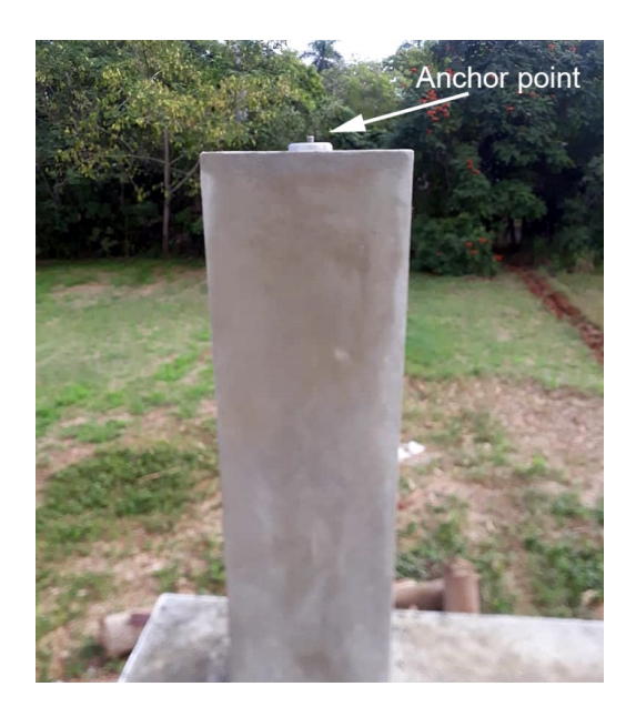
Figure 7. Concrete pillar with a platform for a GNSS antenna mounting.

The installation of several different space-geodetic instruments on the site of the Russian-Cuban co-located station suggests the possibility of their high-precision reference to the fundamental geodetic benchmark. Works on creation of a local geodetic network were carried out to meet this requirement.