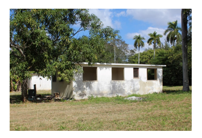
Figure 5. General view of the GNSS service building from the south side.

Fig. 6 shows the layout of the Topcon CR-G3 GNSS antenna and the Vaisala WXT536 weather station. The GNSS antenna is mounted on a platform at the top of the concrete pillar (figure 7), on the roof of the GNSS service building. The anchor point of the platform with coordinates 23.069163 N and -82.459731 E will become the main reference point of the GNSS service, as well as part of the local geodetic network. The antenna is connected by a coaxial cable to the GNSS receiver located in a floor cabinet in the GNSS service room. The automatic weather station is mounted on a metal mast 4.5 meters high, located 20 meters south of the GNSS service building, equipped with a lightning rod and surge protection device and connected by a multi-core signal cable to the interface converter located in a floor cabinet. Cables are laid along walls, roofs and