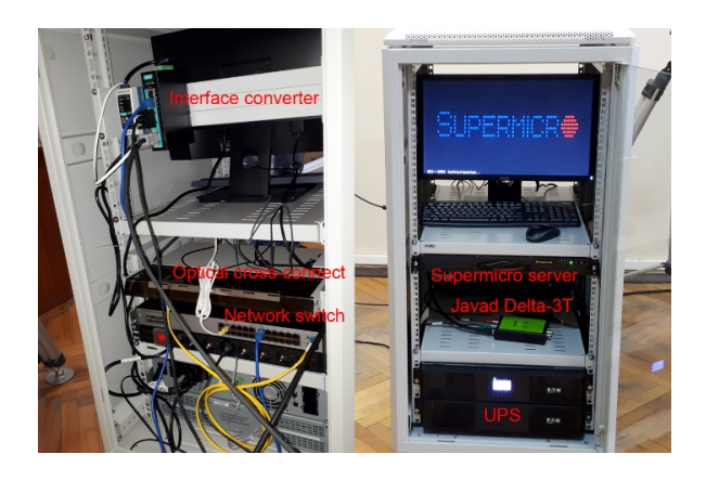
Figure 3. Laboratory assembly of equipment of the Russian-Cuban co-located station (Floor cabinet).