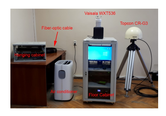
Figure 2. Laboratory assembly of equipment of the Russian-Cuban co-located station (general view).

To configure and test the equipment, the operating system "Microsoft Windows 10", all the necessary device drivers and special software for controlling the GNSS receiver "Javad Net Hub" and the weather station "Vaisala Configuration Tool" were installed on the server. Communication between the weather station and the GNSS receiver is implemented via COM-ports using a special script written in the Python programming language. Storage and transfer of data to the IAA server is performed using the "Nexcloud" software.